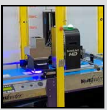
HD Continuous on a Multifeeder