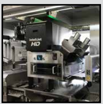
HD ServoWAS on a Pharma Blister Pack Machine