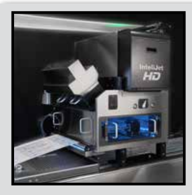
HD ServoWAS on a HFFS